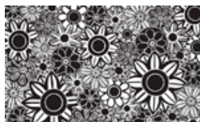
7107-K \frac{5}{8} yd