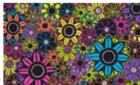
7107-M 1\frac{1}{8} yds