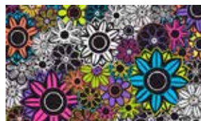
7107-KM 1\frac{1}{4} yds