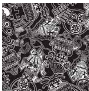
7104-K \frac{3}{4} yd (binding)